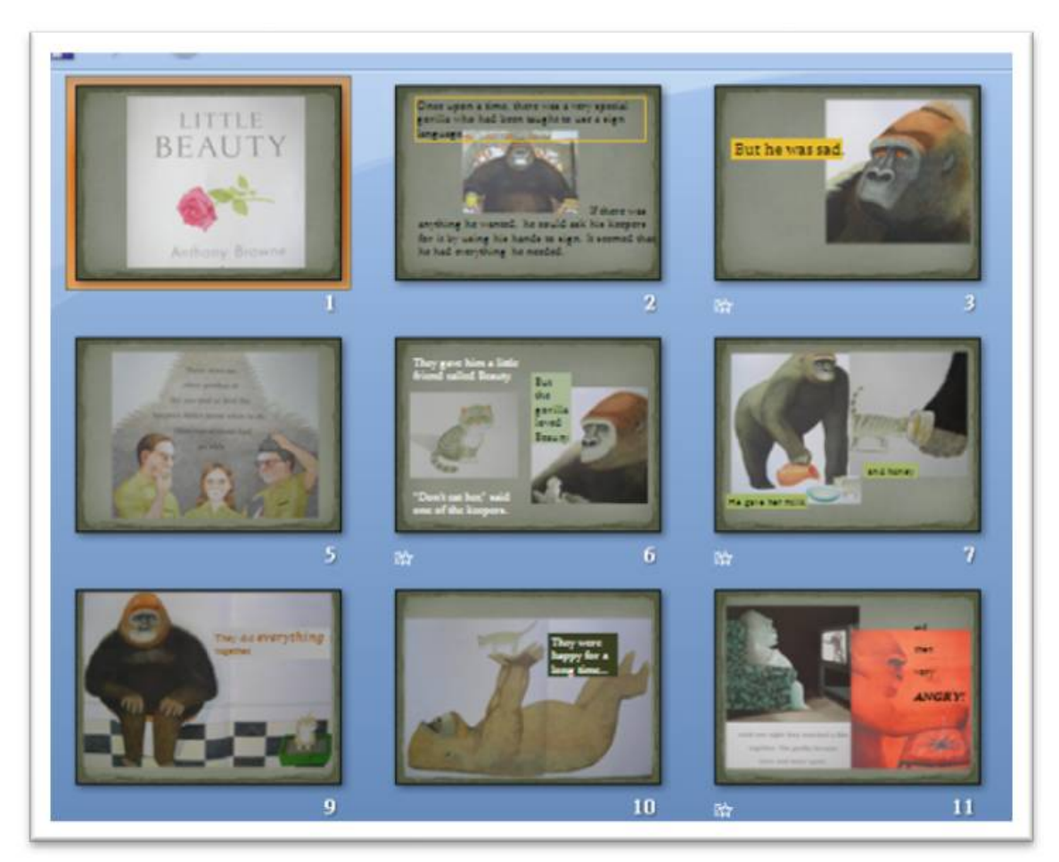
Figure 1. The Power Point Slides of Little Beauty

Using PPT designs to present stories may not be new. The use of the VoiceThread system has also been popular in education at all levels and for many different subjects, including teaching foreign languages (see http://voicethread.com/about/library/ for comments from teachers who have been utilizing the system). No studies have been done, however, to examine the application and usefulness of these technologies for teaching a foreign language to children with learning difficulties. The second aspect of this study thus investigated if using technology helps children comprehend the stories better, improve their learning motivation, and enhance their English learning in the regular English class.